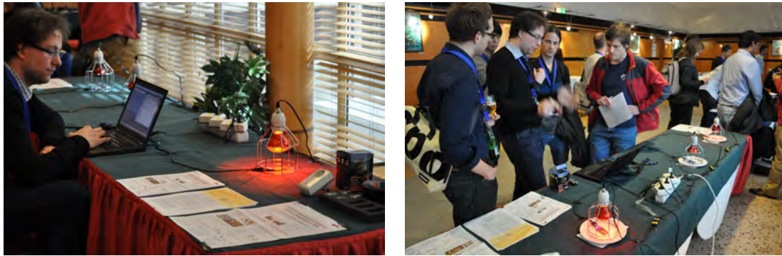
Figure 2.4: The RELYonIT demo at the 11th IEEE Conference on Pervasive Computing and Communications (PerCom) held in Budapest, Hungary, during March 2014.