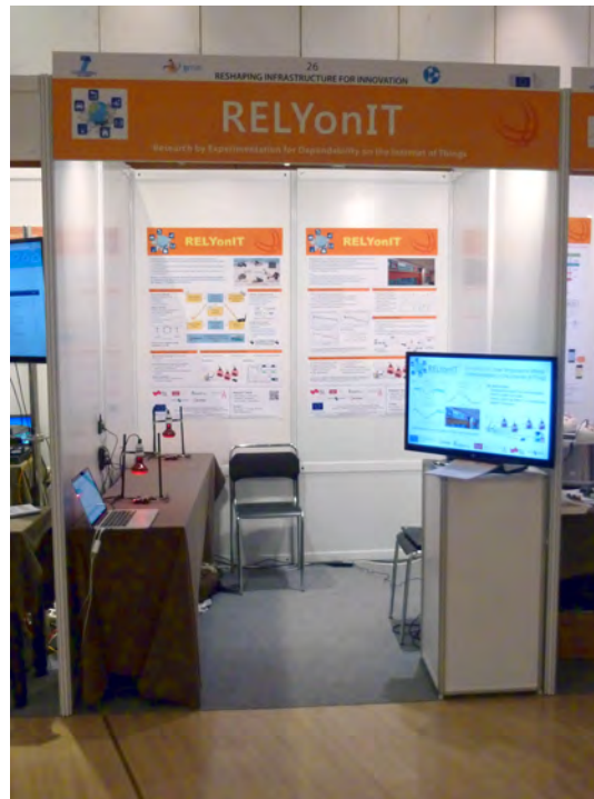
Figure 2.3: The RELYonIT demo at the Future Internet Assembly 2014.