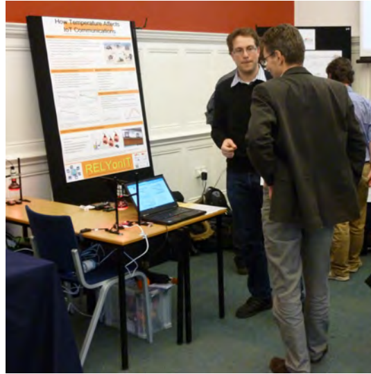
Figure 2.2: The RELYonIT demo at the 11th European Conference on Wireless Sensor Networks (EWSN) held in Oxford, United Kingdom, during February 2014. The demonstration received the best demo runner-up award.