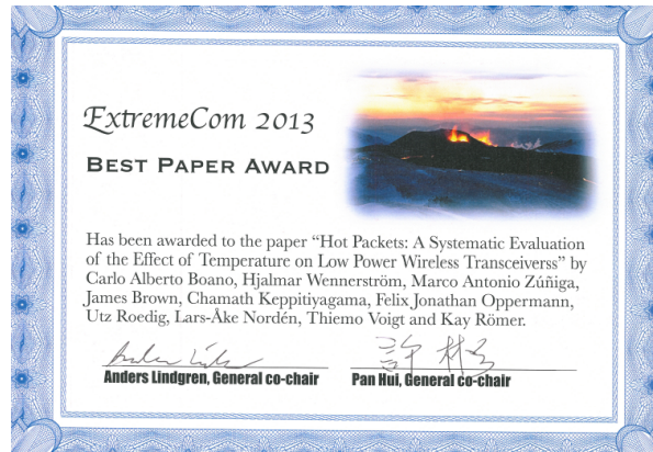
Figure 2.3: Best paper award for the paper “Hot Packets: A Systematic Evaluation of the Effect of Temperature on Low Power Wireless Transceivers” [5] at the 5th Extreme Conference on Communication (ExtremeCom) .

part of invited talks and presentations.